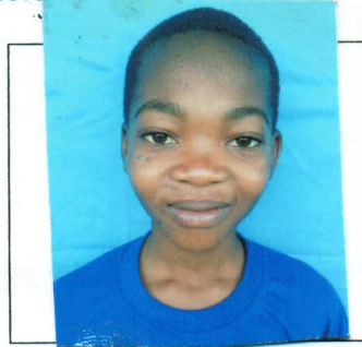
Photo of the child to be sponsored